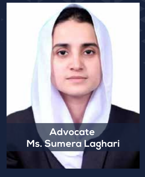
*Pseudonym used to protect privacy.