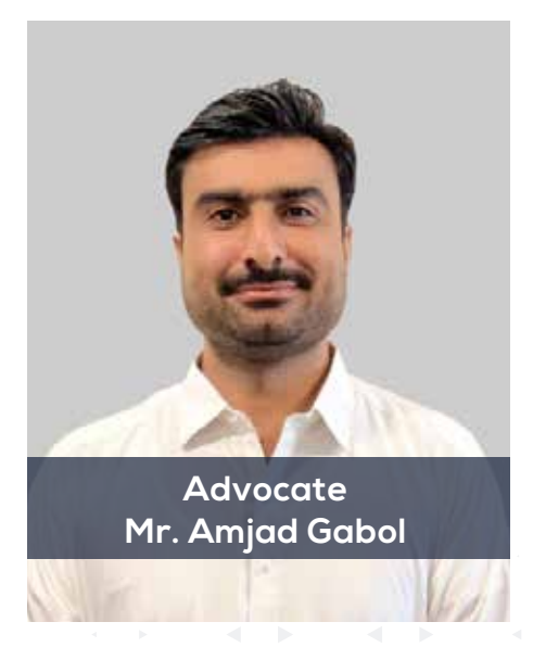
*Pseudonym used to protect privacy.

The resolution of Ahmed's case was achieved within a remarkably short span of 12 days. Without the intervention of the Committee, he would have faced a potential imprisonment sentence of up to seven years, in addition to a substantial fine.